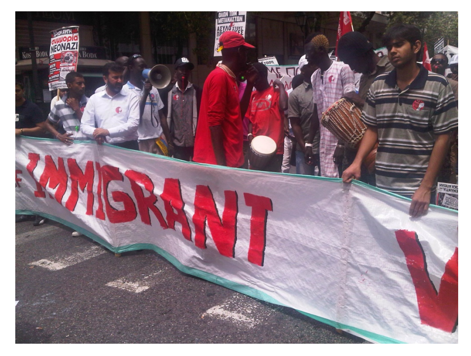
12.32pm Today's Greek General Strike

Comrades tell me that by evening there will be the customary police tear gas and baton charges.