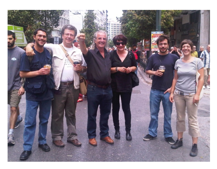
12.21 pm Today's Greek General Strike 15 June 2011

The official general strike is against IMF and EU demands for a further austerity budget, more actual pay cuts, privatisation, cuts in benefits.