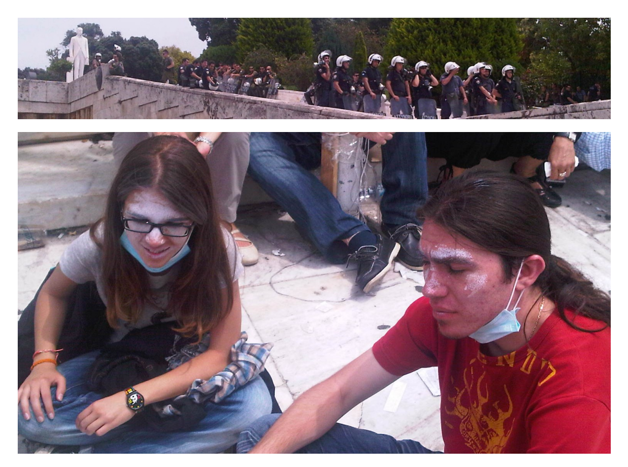
Demonstrators wearing face cream, to protect their faces against the tear gas